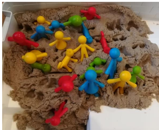
Figure 6: Hugh's sand tableau

In his sand tableau (figure six) Hugh presents his family in terms of their emotions and moods, representing them multiple times in different colours to represent their different moods,