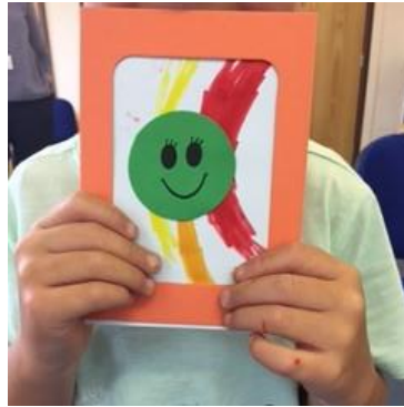
Figure 7: Carl's picture of taking part in VIG